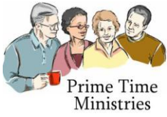
Prime Time Ministries

The A.A.R.P. defines “seniors” as people over 50. The Social Security Administration uses the more arbitrary figure of 65 years. We used to call